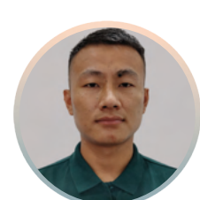
LOLI LODZIIO KHRASI HISTORY (2023) RANK 5