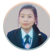
LOSII SAZIIA HISTORY (2020) RANK 7