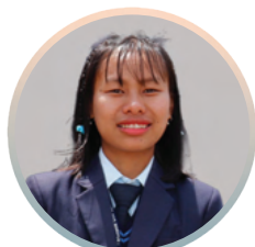
S. PFOSII-A HISTORY (2022) RANK 3